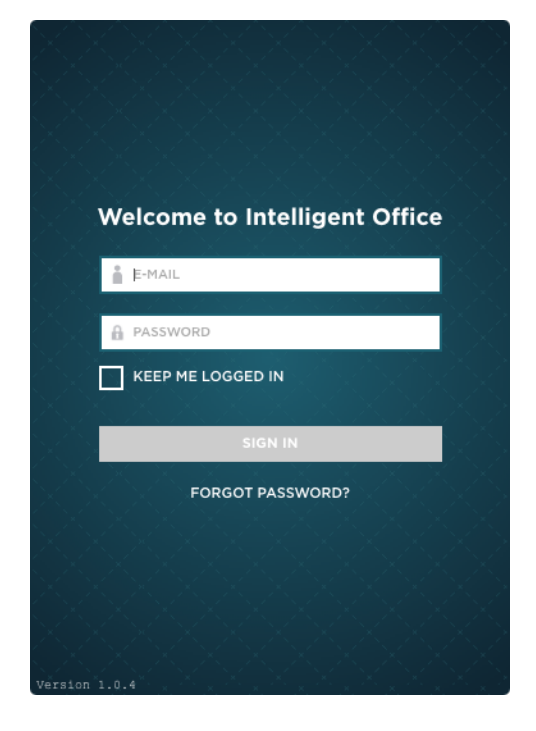
Figure 6 - Welcome to Intelligent Office login window.

The first time the application is launched the "Welcome to Intelligent Office" sign in window will be visible. The user must sign in with his/her user account to use the application.